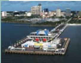
St. Petersburg, Florida